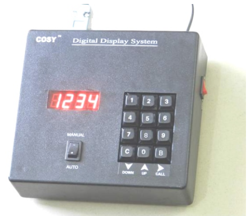
Sturdy Compact Plastic Moulded Control Unit. Slim 3 core interconnecting cables